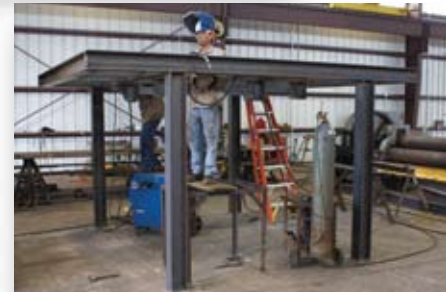
Drilling rig shaker deck platform