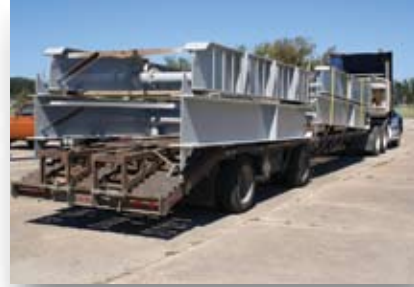
Riser rack stanchion sections