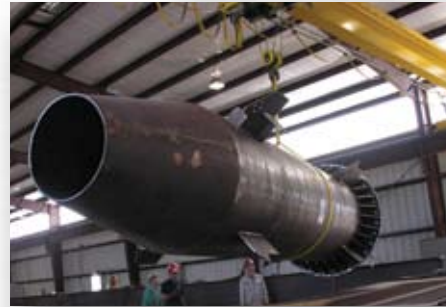
Crane column support